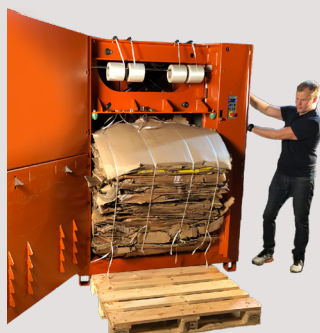
Simply push two buttons for bale ejection!