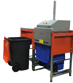
Designed to fit the standard 360 Liter bins in the market.

Model 4360 is user-friendly! The multi-chamber version is a convenient top-loading installation, while the single-chamber version has an easy wheel-in, wheel-out operation. Safety and quality are our hallmarks and the compactor provides maximum personal safety both for the operator and those in the immediate vicinity. A bin indicator assures that the machine can only start, when the bin is in the right position.