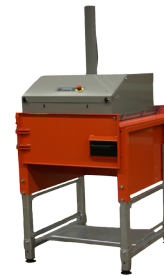
The single-chamber unit with swing door