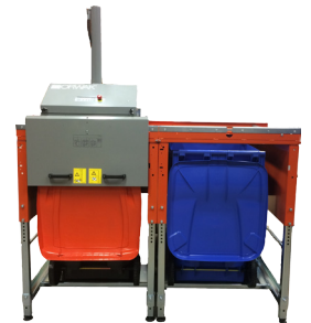
The multiple-chamber unit equipped with an apron with two handles